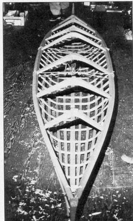
Below—The deckbeams fit into mortises cut into the gunwales.